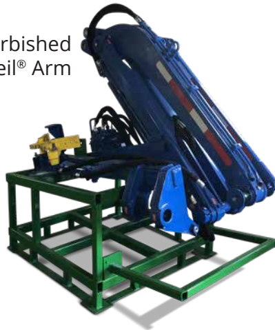
Refurbished Heil ® Arm