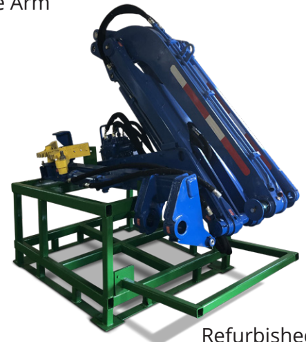
Refurbished Heil Arm