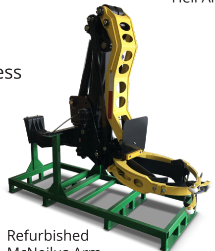
Refurbished McNeilus Arm